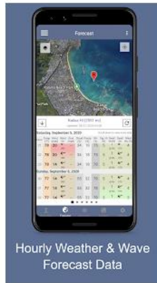
Hourly Weather & Wave Forecast Data