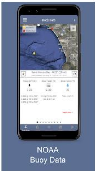
NOAA Buoy Data