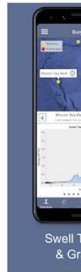
Swell Time & Growth