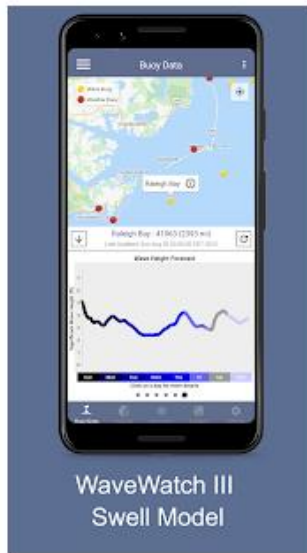
WaveWatch III Swell Model